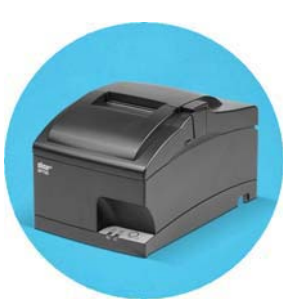
Optional Purchase: Cashbox / Receipt Printer

Optional Purchase: Kitchen Order Printer